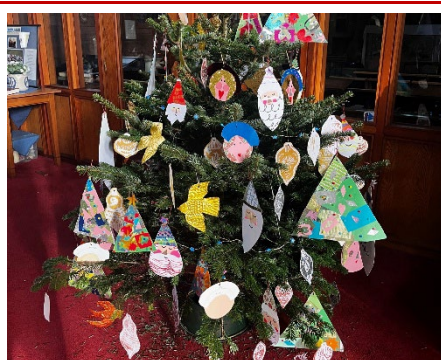
'Arty Stars' Club decorations.