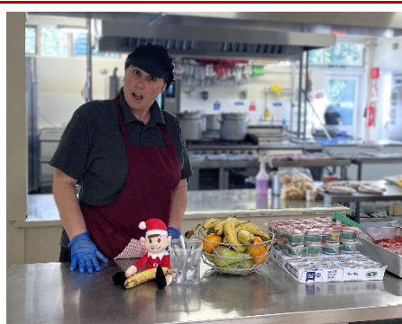
The Naughty Elf stole a banana!

In case you have missed any of the Advent Calendar doors on the website, here are some of the surprises that have been revealed so far!