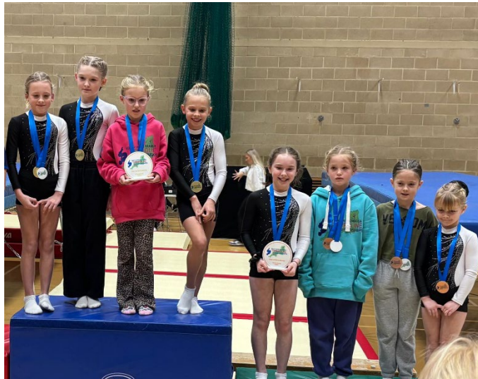
The girls novice team took 1 st AND 3 rd place on the Podium.