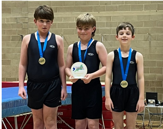
The boys novice team came 1st!

Well done to everyone - they next compete in January 2026 (and perhaps we have some Olympic potential to keep an eye on!)