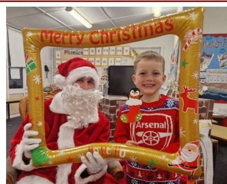
Santa at the Xmas Fair!